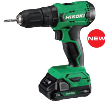
Cordless Impact Driver Drill 18V DV 18DA