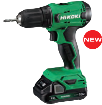
Cordless Driver Drill 18V DS 18DA