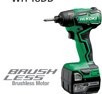
Cordless Impact Driver WH 18DD